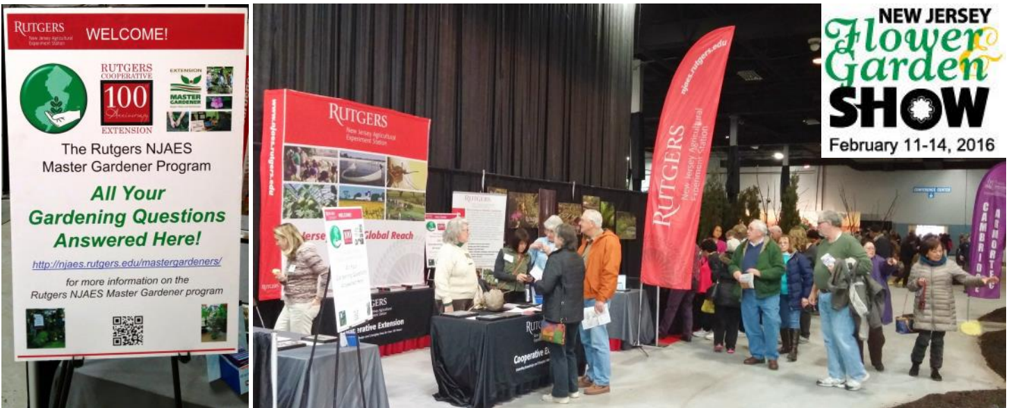
New Jersey Flower and Garden Show