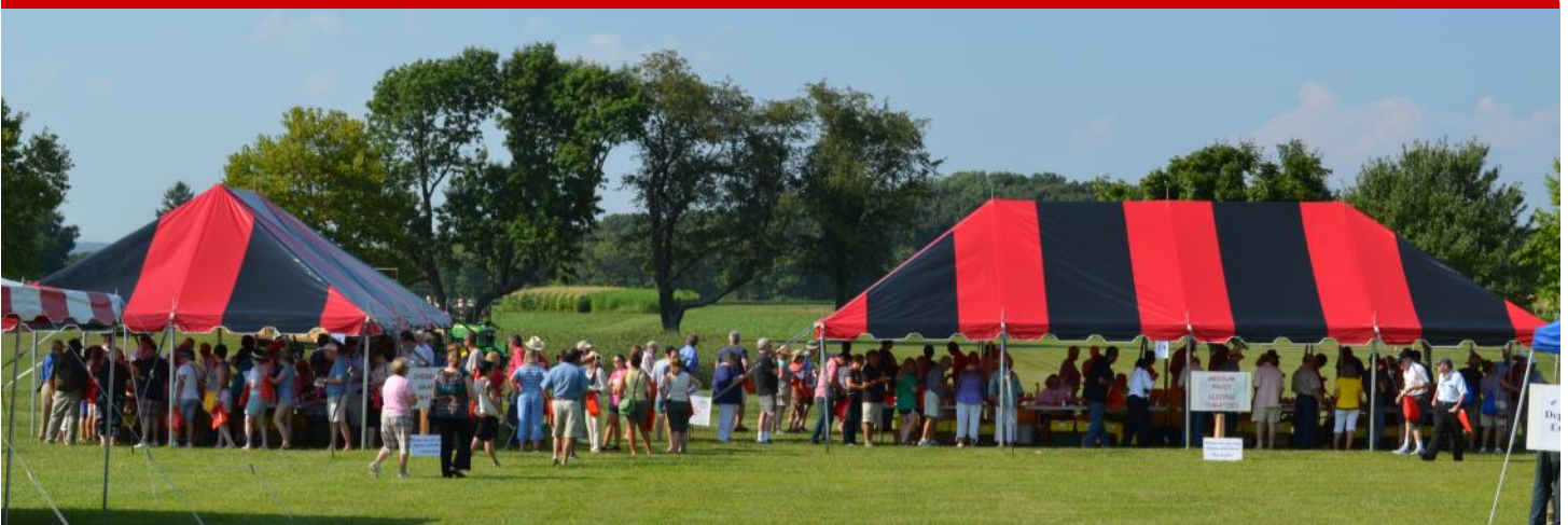
Snyder Farm Open House and Great Tomato Tasting