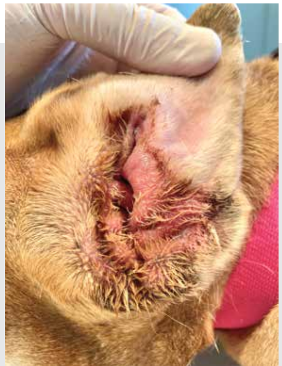
FIGURE 1. Suppurative otitis with erythema and purulent discharge in an atopic dog with secondary Pseudomonas otitis.

As with Malassezia , bacterial ear infections are considered secondary problems; if bacterial infections are recurring, the patient should be thoroughly investigated for primary underlying diseases, such as allergies. The most effective diagnostic tool for identifying (cocci and/or rod shape) and quantitatively assessing bacteria is cytology. Because bacterial otitis externa is treated topically, bacterial culture and