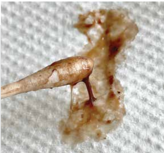
FIGURE 2. Dark, slimy otic discharge from a dog with Pseudomonas otitis and biofilm.

Various parasites (e.g., Otodectes , Sarcoptes , Notoedres , and harvest mites; ticks) can affect the external ear